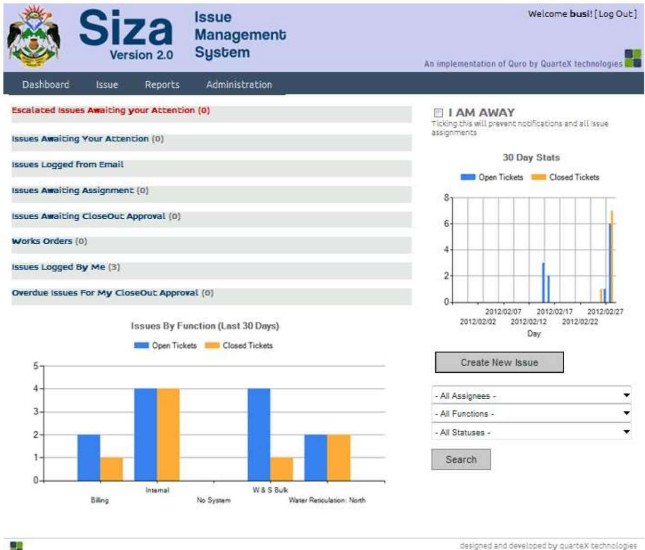
Figure 8.2 (a): Siza Dashboard

ZDM has developed a system for the capturing and tracking of customer complaints, from the point where the complaint is recorded by the Customer Care centre, referred to specific individuals to deal with and closed out when finally dealt with. The system is called SIZA and records the time from when the complaint was lodged until the issue has been successfully completed. Response time to consumer complaints and the time it takes to deal with issues are therefore measured and can be reported on. Figures 8.2 a,b,c provide a view of system functionality.